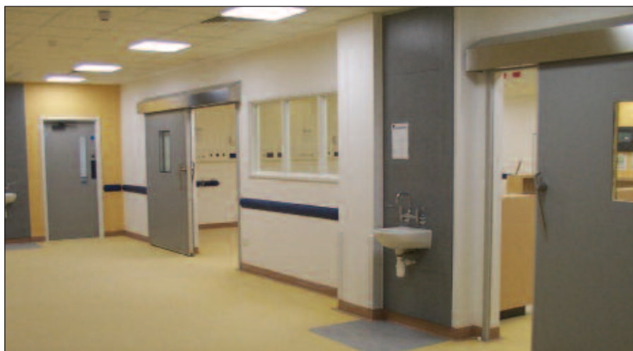
Sliding doors are becoming increasingly popular, both in new buildings, and as replacements for existing hinged single and double action doors.

One of the most important aspects of a successful infection control policy, beyond general hygiene, is choosing the correct materials for both the construction of the room and the components within it. Traditionally, most hospital doors are painted wooden or wooden cored laminate. However, because of increasing standards of