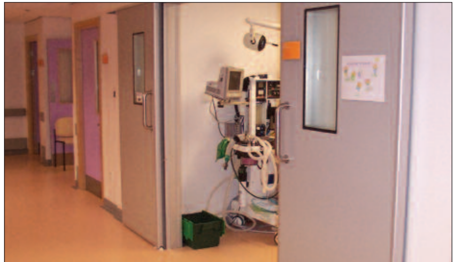
Dortek says that, in the Netherlands and Switzerland, use of hermetically sealing doors has helped dramatically reduce hospital-acquired infections.

The guidance note calls for smooth, hard impervious surfaces which are easy to clean and durable. Ledges, recesses and right angles where dust particles can be trapped should, it says, be avoided to allow ease of cleaning. Alongside the clinical environment, another potential