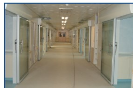
With 2 x 6mm thick hardened glass, flush fixed with anodised aluminium door blades, these MF5 hermetically sealing glass doors maximise natural light

GRP is manufactured from millions of strands of glassfibre and polyester resin. ►