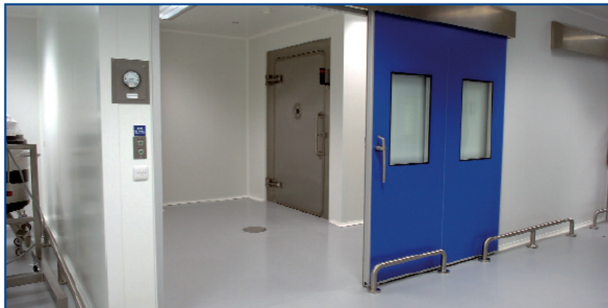
The MF5 door is designed for use in pharmaceutical cleanrooms, production and packing facilities

In a pressurised environment allowing two doors to open at the same time will